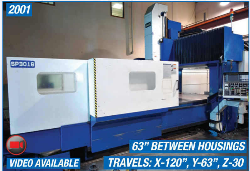
AWEA SP3016 CNC BRIDGE TYPE VERTICAL MACHINING CENTER