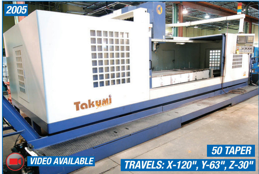
TAKUMI V32 CNC VERTICAL MACHINING CENTER