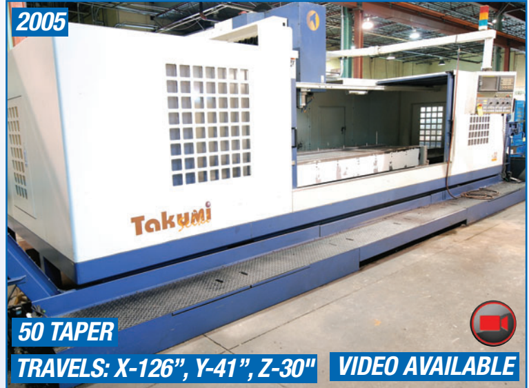
TAKUMI V32 CNC VERTICAL MACHINING CENTER