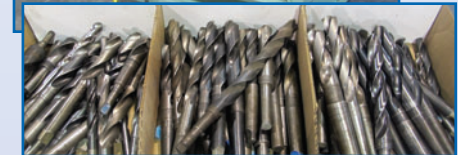
PARTIAL VIEW OF TOOLING