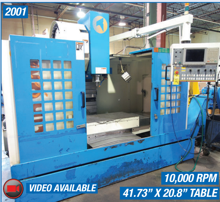
TAKUMI V10A CNC VERTICAL MACHINING CENTER