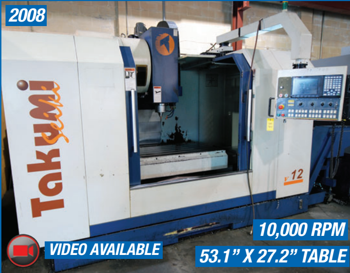
TAKUMI V12 CNC VERTICAL MACHINING CENTER