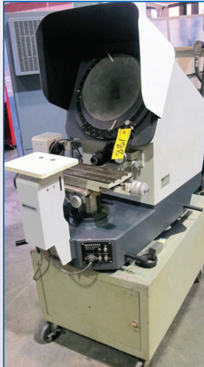
MITUTOYO PH-350 OPTICAL COMPARATOR