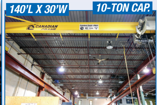
CANADIAN CRANE FREE STANDING CRANE SYSTEM

Visit infinityassets.com for complete specs and additional photos