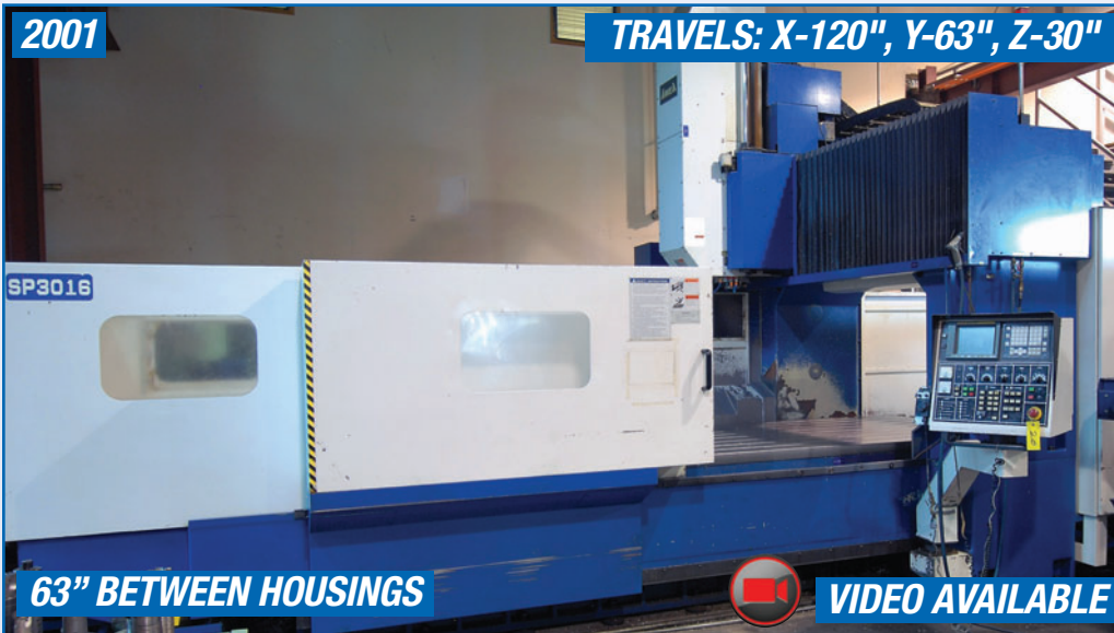
AWEA SP3016 CNC BRIDGE TYPE VERTICAL MACHINING CENTER