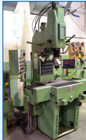
HAUSER 4SM JIG