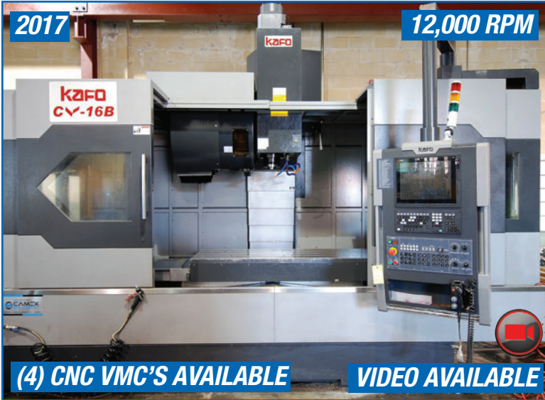
KAFO CV-16B CNC VERTICAL MACHINING CENTER