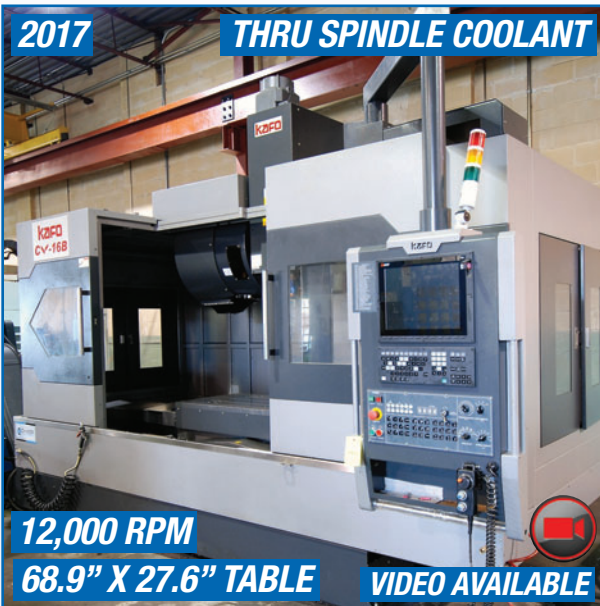
KAFO CV-16B CNC VERTICAL MACHINING CENTER